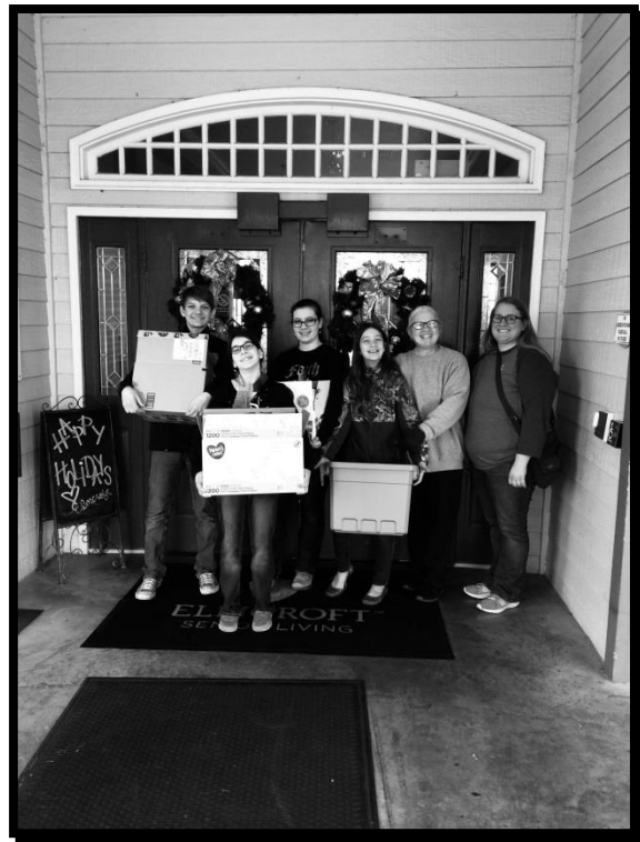
Delivering stockings to nursing home staff on Christmas Eve